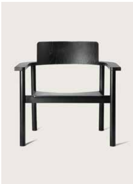
RUDI LOUNGE ARMCHAIR